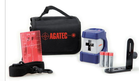
INCLUDES Laser, pouch, 3 x AA batteries magnetic mount, target plate